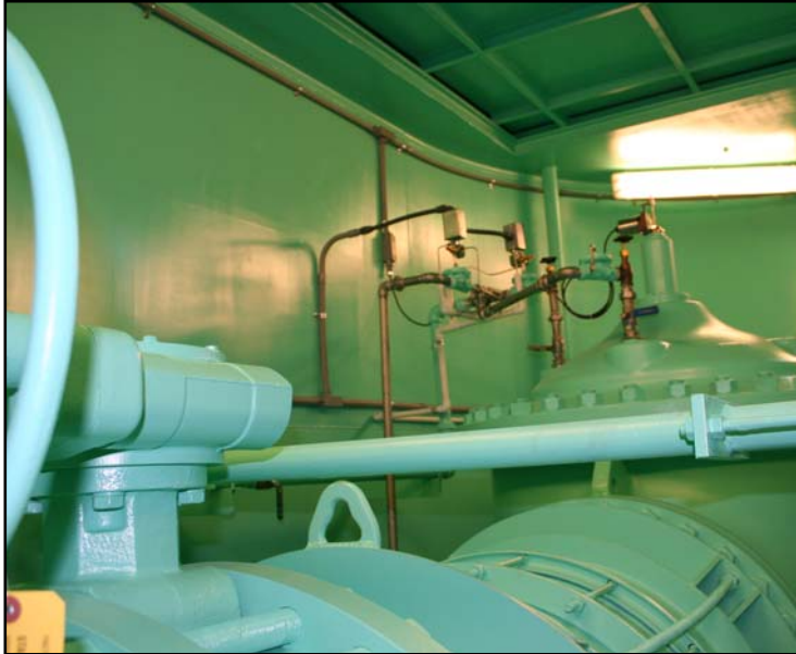
This picture shows the tank top sheet with a steel, reinforced 7' x 7', equipment hatch above the valve for valve withdrawal and for lifting the dome off the valve for servicing the internal parts when required.