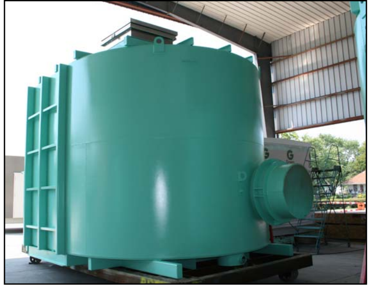
This picture shows the exterior of the finished 36" pressure reducing valve station ready for shipping.