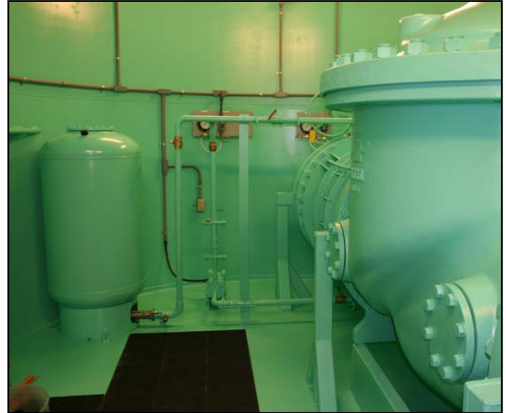
This picture shows the pilot water system tank, pump and piping. Behind the 36" control valve is shown the breakaway coupling included to facilitate valve withdrawal if ever required.