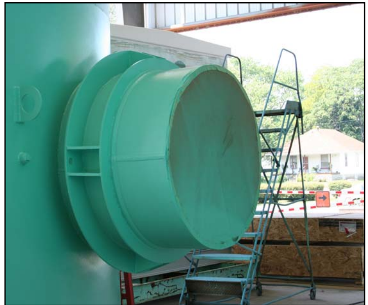
This picture shows the AWWA-M-11 restraints system built onto the transmission piping.