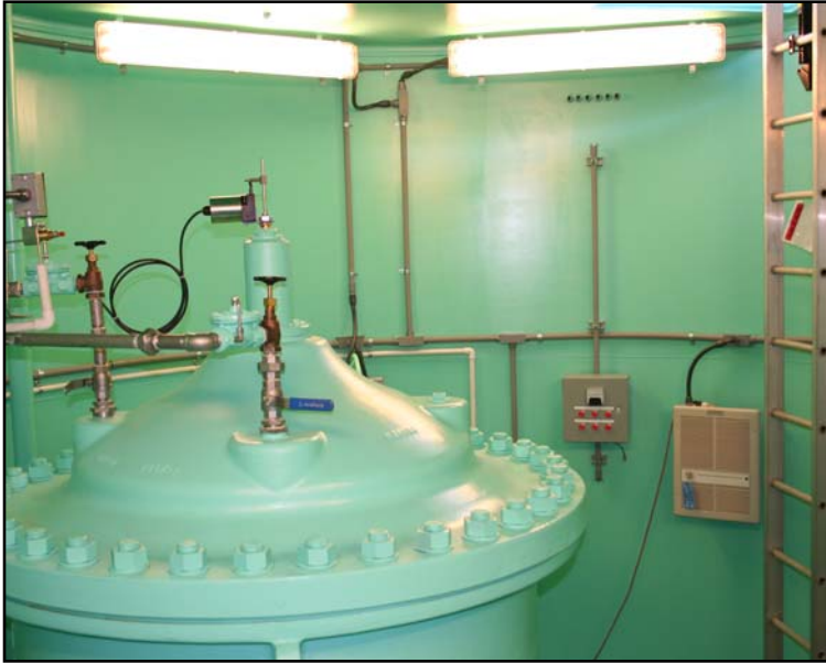
This picture shows the cover chamber and the tank wall welding along with the ladder to the manway hatch, the heater and the cathodic protection system, anode test station.